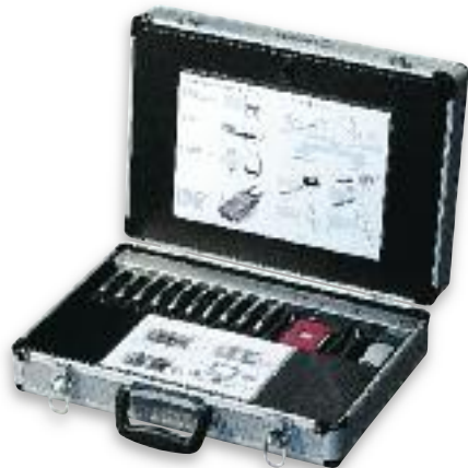
Charging Suitcase for 10 MyLink FM receivers

The MyLink FM receiver is a robust, small and handy device that requires very little maintenance. A handy charging and transport case provides professional storage for all equipment.