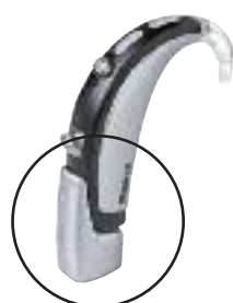
Hearing device with miniature FM receiver below