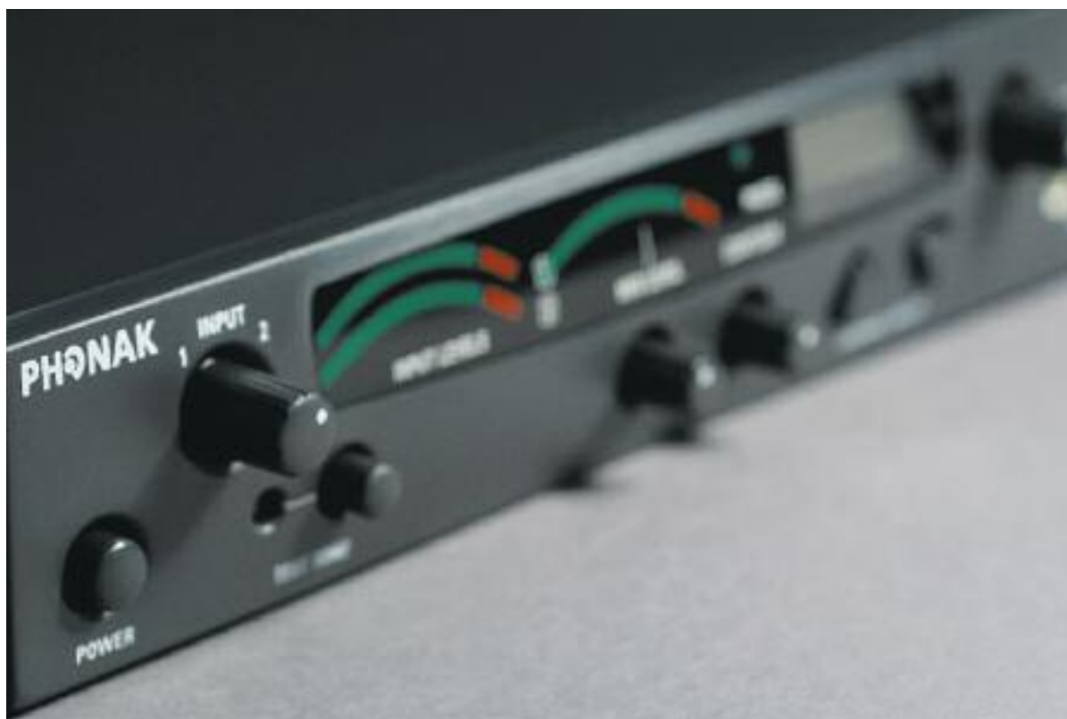
TX-300 V, wide area transmitter

If you wish, our account manager can make an appointment for a visit and discuss the possible options for your theatre.