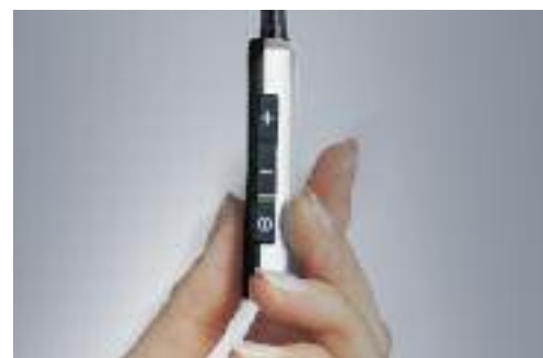
Volume control (+/-) and on/off switch