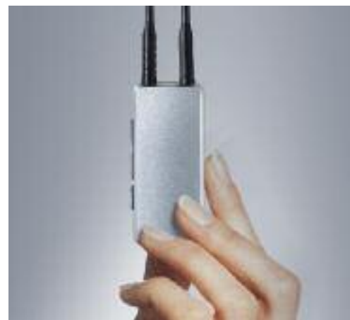
MyLink, universal FM receiver