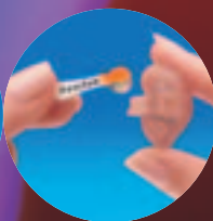
EASY TO INSERT

Use this simple guide to check which size of Activair® battery you need.