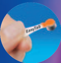
EASY TO HOLD